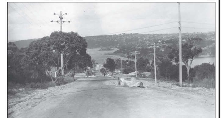
Beatrice Street looking south, 1936.